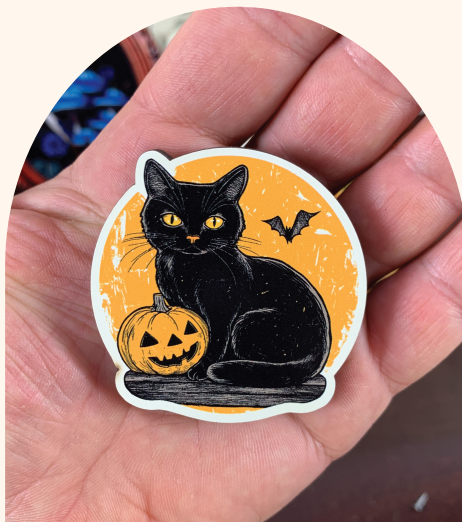
UV printing, signage, fine art, magnets, ornaments, and more