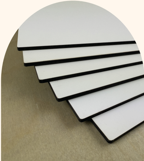
Ultra-white flat front, flat black back