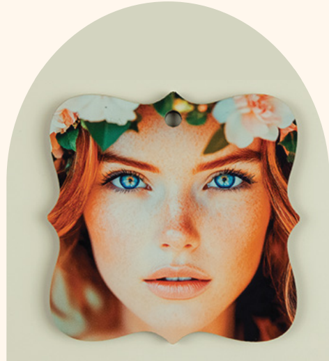
Achieve Superior Print Quality